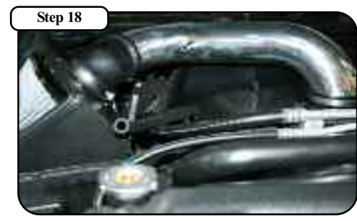
Place intake tube into the couplings and make sure the elbow coupler is in the correct position and is not kinked before tightening all clamps.