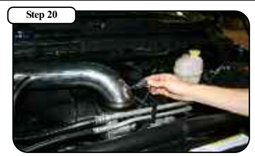
Reinstall your tempature sensor plug and press the red tab back to lock it into position.