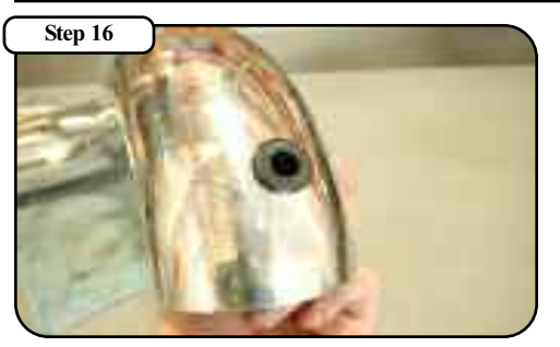
Place the provided grommet into the hole on your new aFe intake tube. Note: Tube finish may vary from photos.