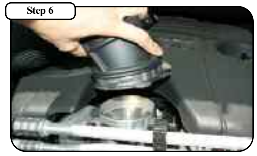
Pull up on the stock intake tube to remove it from the throttle body.