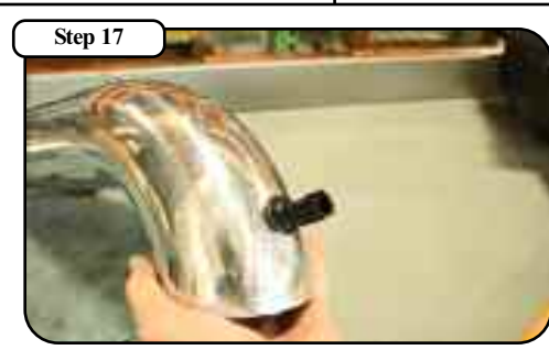
Install your tempature sensor into the grommet.