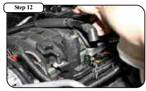
Twist the crank case breather line and pull it directly up to remove.