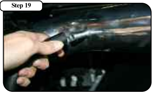
Plug in the supplied crank case breather hose to the intake tube nipple.