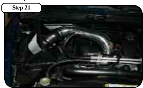
Your install is complete. Make sure all clamps are tight and all electical connections are secure. Retighten all clamps after a few hours of use.

NOTE:Place enclosed CARB EO sticker on a clean/smooth surface on or near the intake system. EO identification label is required to pass the smog inspection.