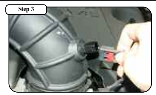
Disconnect the tempature sensor by sliding back the red clip, then pushing the black release tab and pulling