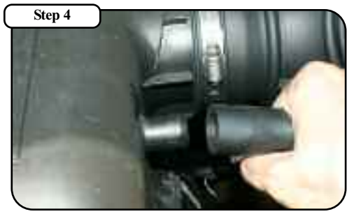
Unplug the crank case breather tube.