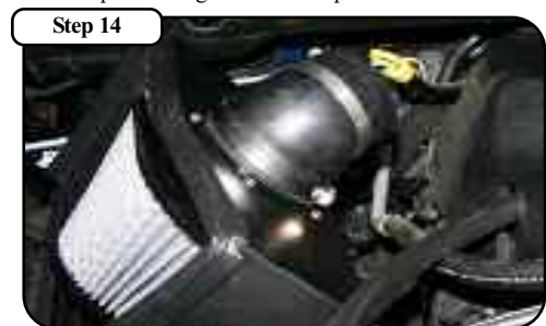
Place the elbow coupling onto the adapter but do not tighten clamp until later.