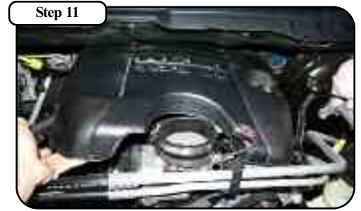
Remove the engine cover by pulling up on one side at a time to pop it loose. Install the straight coupling on the throttle body and tighten the lower clamp but leave the top clamp loose.