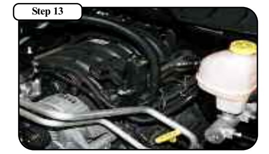
Replace old crank case breather line with the hose provided and run in direction of the OEM line and put the engine cover back on. Remember that the engine cover has a slot where this line will come out from.