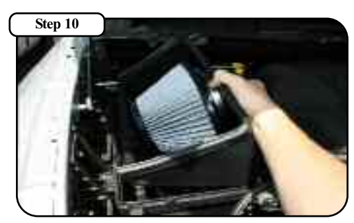
Place aFe housing and filter into the stock OEM Airbox and clip all four clips to secure housing.