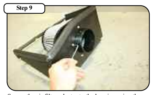
Secure the air filter adapter to the housing using the (5) M6 allen bolts provided. Then place filter onto filter adapter and tighten the clamp.