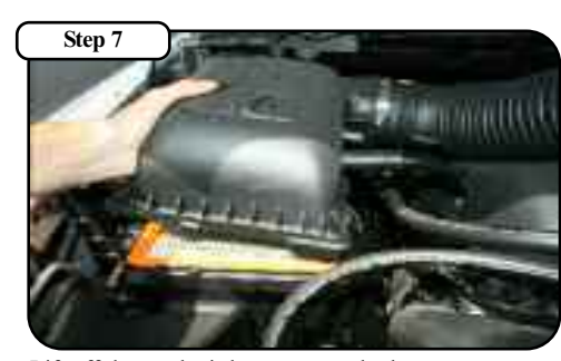
Lift off the stock air box cover and tube.