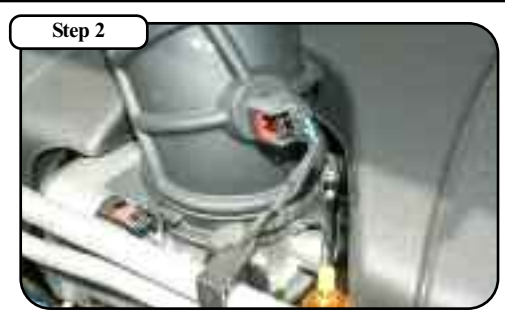
Loosen the clamp at the throttle body.