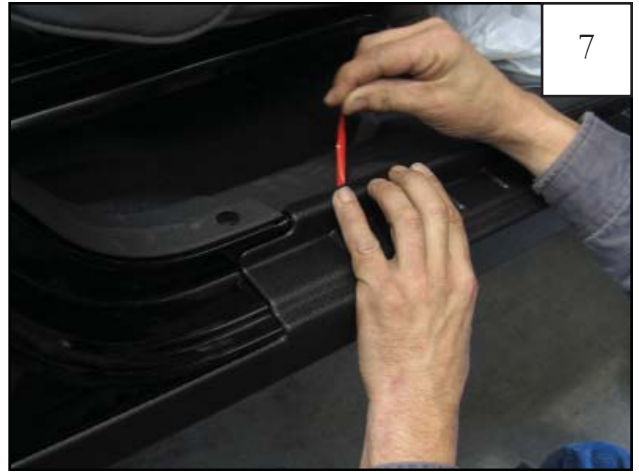
Pull 1/4" tape liner tab 2. NOTE: Refer to step 1 for additional tape tab identification.