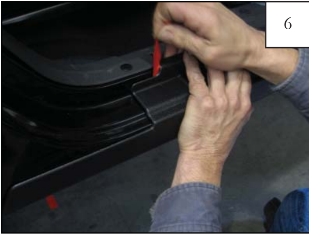
Pull 1/2" tape liner tab 1. NOTE: Take care not to catch tape liner of other pieces of tape and accidentally pull their liners off as well. NOTE: Refer to step 1 for additional tape tab identification.