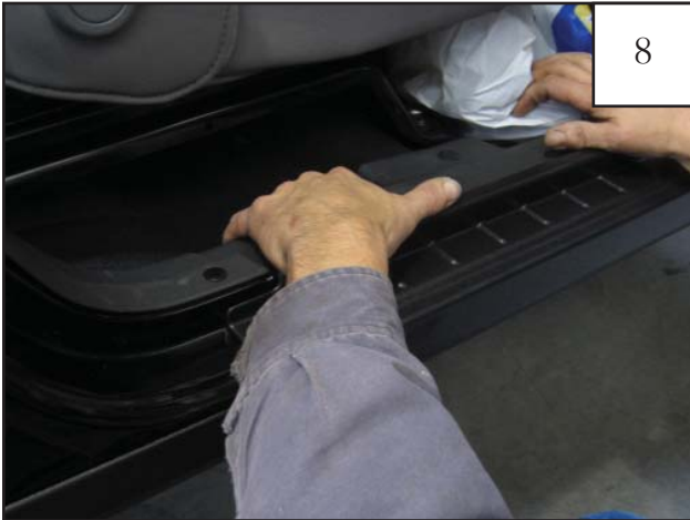
Press down firmly on part along the length of the sill.