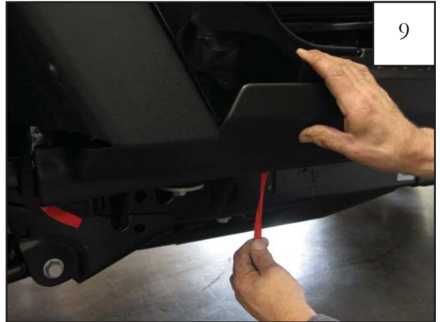
Toward the rear of the vehicle, pull 1/2" tape liner tab 3. Press firmly on the part following tape liner removal. NOTE: Refer to step 1 for additional tape tab identification.