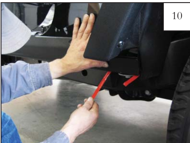
Toward the front of the vehicle, pull 1/2" tape liner tab 4. Press firmly on the part following tape liner removal. NOTE: Refer to step 1 for additional tape tab identification.