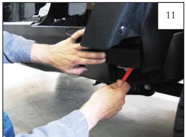
Toward the front of the vehicle, pull 1/2" tape liner tab 5. Press firmly on the part following tape liner removal. NOTE: Refer to step 1 for additional tape tab identification.