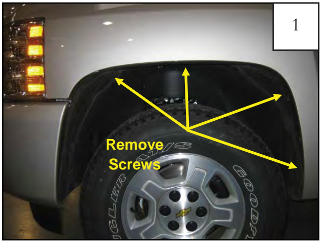
Using a 7mm socket, remove four factory screws. Keep screws for later use.