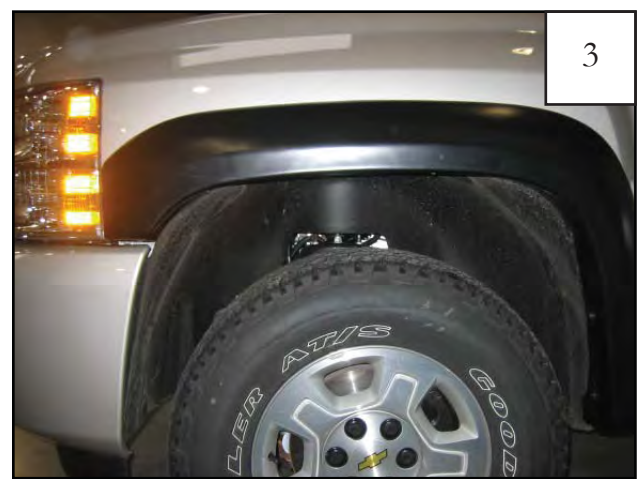
Verify fit and tighted all screws. Follow steps 1-3 for passenger side installation.