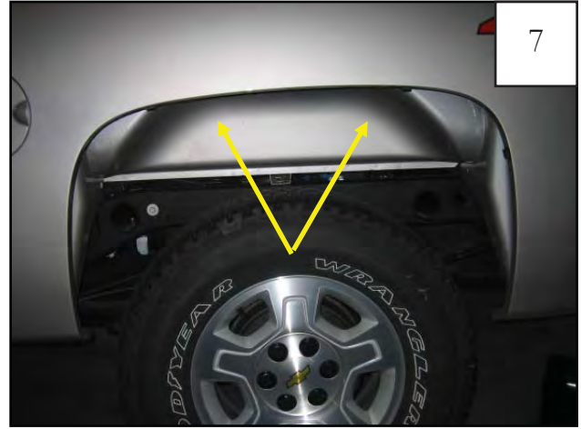
Plastic Clip locations.