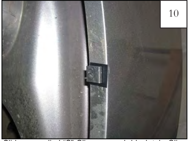
Slide a supplied "S" Clip over each black tab. Clips may need to be adjusted to align with holes in flare. Clips on bottom may need to be pinched in order to stay in position on fender