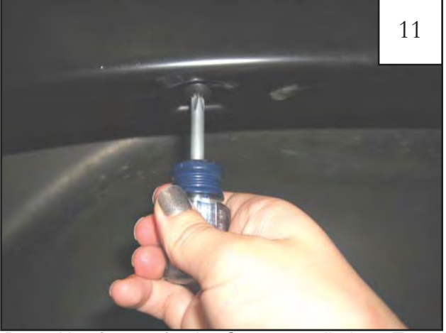
Reposition flare on fender. Start a supplied #14 Truss Head Screw through each topmost hole in the flare, and into each Plastic Clip installed in Step 6.