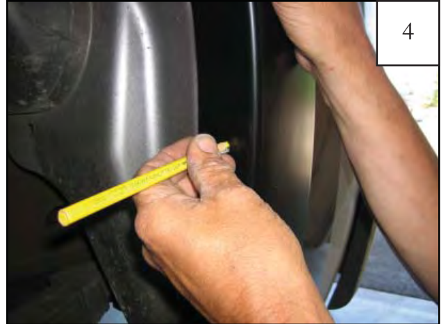
Holding flare in position on fender, use a grease pencil to mark six hole locations. Note: Rear Flares look very similar. Verify that you have the correct side prior to installation.