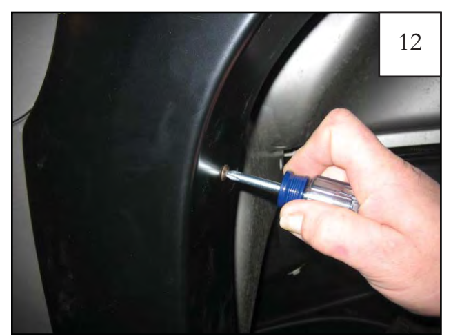
Start a supplied Serrated Flange Screw through each of the remaining holes and into each "S" Clip installed in Step 10. If needed, use awl to locate holes.