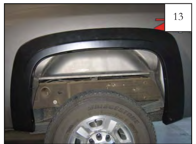
Verify fit and tighten all screws. Repeat steps 4-13 for passenger side installation.