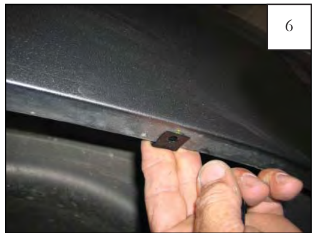
Slide a supplied Plastic Clip over two top factory holes. Clips may need to be adjusted to align with holes in flare. Note: the raised collar on the clip should face upward into the interior of the fender.