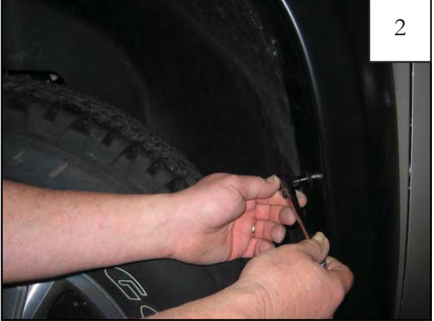
Position flare on fender and reinstall the four factory screws removed in Step 1, be sure to not tighten.