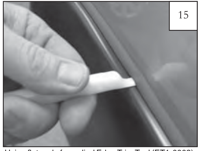
Using flat end of supplied Edge Trim Tool (ET1-0002), seat edge trim against flare by inserting straight end between edge trim and flare at one end. Next, slide around entire edge to the other end.