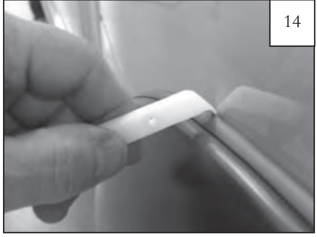
Using supplied Edge Trim Tool (ET1-0002), seat edge trim against vehicle by hooking curved end under edge trim at one end of flare. Next, slide around outer edge of flare to the other end.