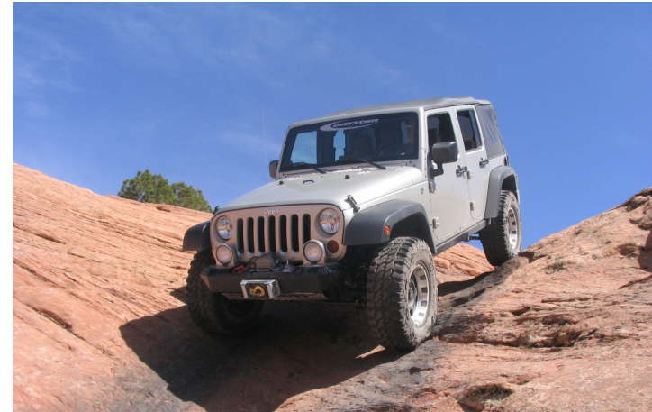
Hells gate, Moab UT