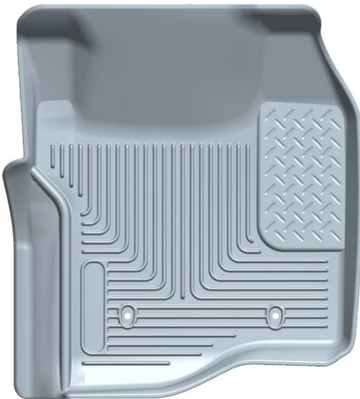
LEFT OR DRIVER

Your liners are made from an engineering resin that is lightweight and extremely tough and durable. The easiest way to clean your liners is with a damp cloth or sponge and soap and water. Windex®, 409® and ArmorAll® type cleaners work as well.