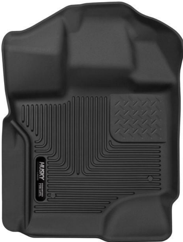
LEFT OR DRIVER

Your liners are made from an engineering resin that is lightweight and extremely tough and durable. The easiest way to clean your liners is with a damp cloth or sponge and soap and water. Windex®, 409® and ArmorAll® type cleaners work as well.