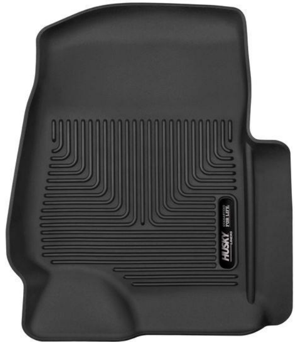
RIGHT OR PASSENGER

TO INSTALL DRIVER'S SIDE LINER SIMPLY POSITION LINER OVER EXISTING RETAINER AND PRESS DOWN TO SEAT LINER OVER THE RETAINER. INCLUDED IN YOUR PACKAGING IS AN ADDITIONAL RETAINING POST FOR THE PASSENGER SIDE. SEE INSTALLATION DETAILS ON THE BACK OF THIS PAGE.