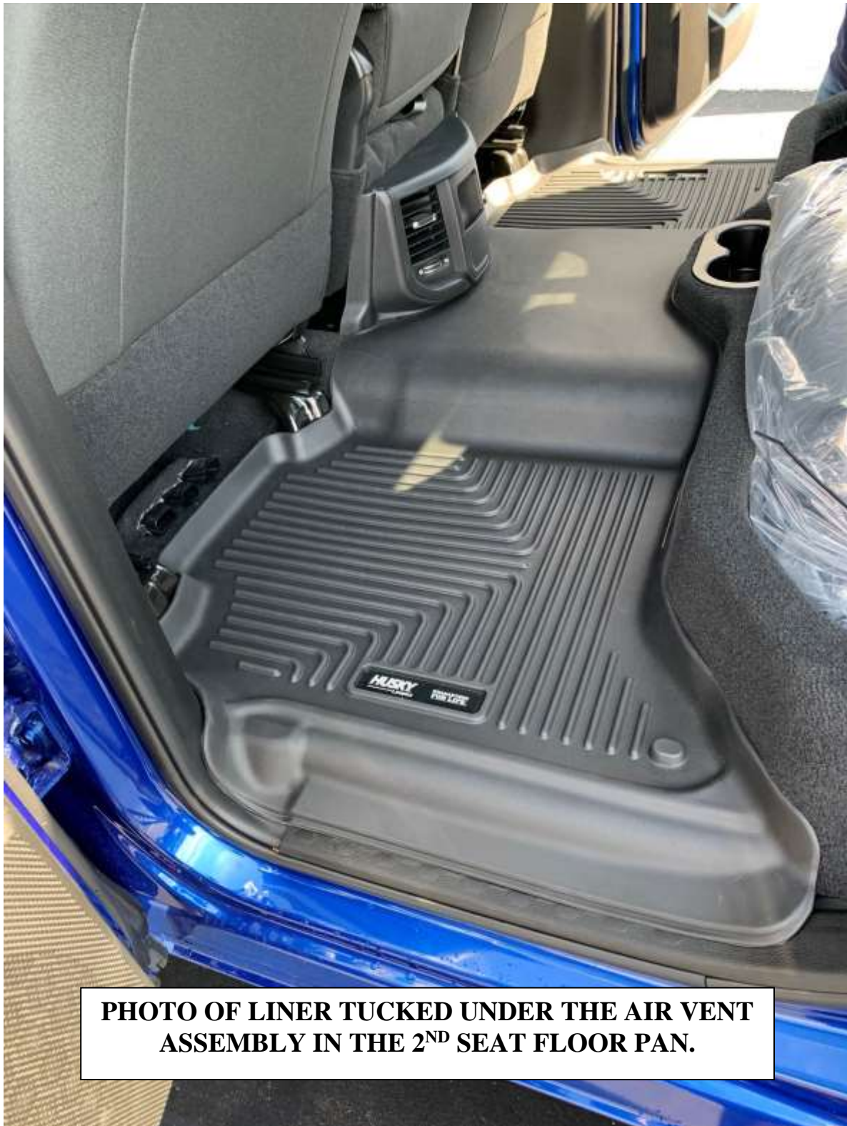
PHOTO OF LINER TUCKED UNDER THE AIR VENT ASSEMBLY IN THE 2 ND SEAT FLOOR PAN.