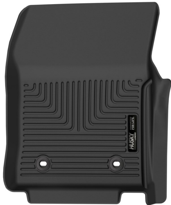
RIGHT OR PASSENGER'S SIDE

TO EASE INSTALLATION OF YOUR FRONT LINERS, MOVE BOTH FRONT SEATS TO THEIR MOST REARWARD POSITION. NEXT, REMOVE ANY EXISTING FLOOR MATS AND INSTALL THE LINERS, POSITIONED AS SHOWN ABOVE. TAKE CARE THE LINERS ARE SECURED TO THE FACTORY FLOOR MAT RETENTION HOOKS LOCATED IN THE VEHICLE FLOOR. ONCE THE LINERS ARE INSTALLED, MOVE THE FRONT SEATS TO THEIR DESIRED LOCATIONS.