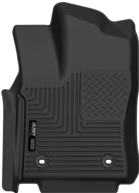
LEFT OR DRIVER'S SIDE