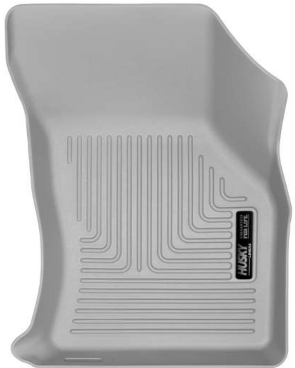
RIGHT OR PASSENGER'S SIDE

TO EASE INSTALLATION OF YOUR FRONT LINERS, MOVE BOTH FRONT SEATS TO THEIR MOST REARWARD POSITION. ONCE YOU HAVE INSTALLED YOUR LINERS, REPOSITION THE SEATS AS DESIRED. TAKE CARE THAT DRIVER'S SIDE LINER IS SECURELY ATTACHED TO THE FACTORY FLOOR MAT POSTS.