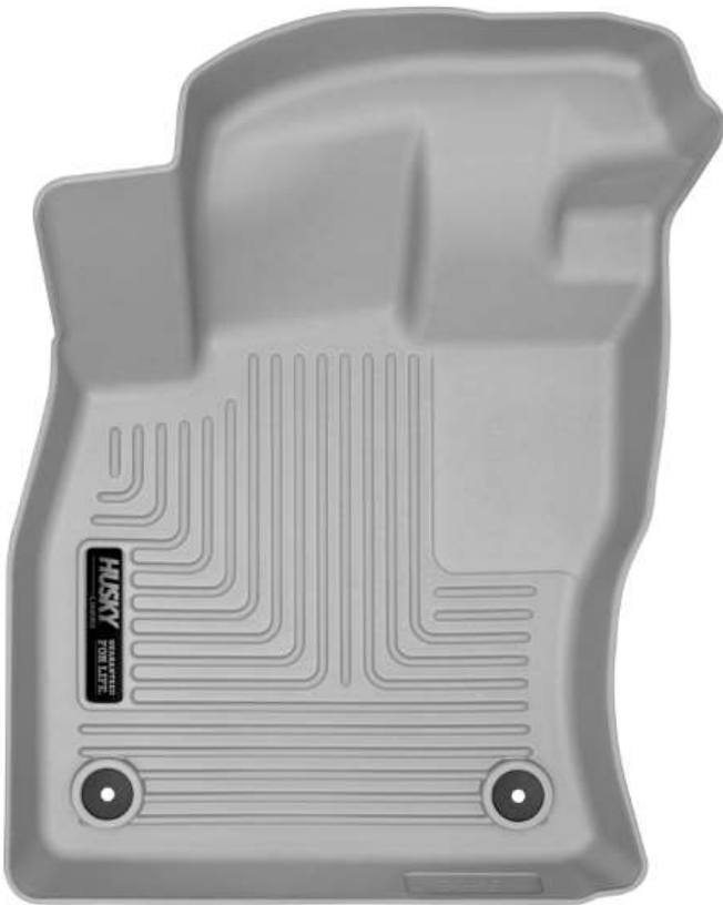
LEFT OR DRIVER'S SIDE