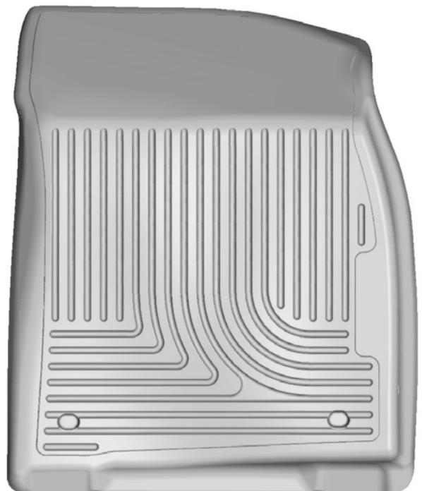
RIGHT OR PASSENGER'S SIDE

TO EASE INSTALLATION OF YOUR FRONT LINERS, MOVE BOTH FRONT SEATS TO THEIR MOST REARWARD POSITION. ONCE YOU HAVE INSTALLED YOUR LINERS, REPOSITION THE SEATS AS DESIRED. TAKE CARE THAT DRIVER'S SIDE LINER IS ATTACHED TO THE FACTORY FLOOR MAT POSTS.