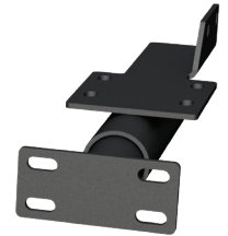
Right / passenger side