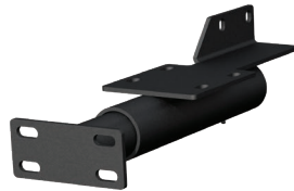
Left / driver side