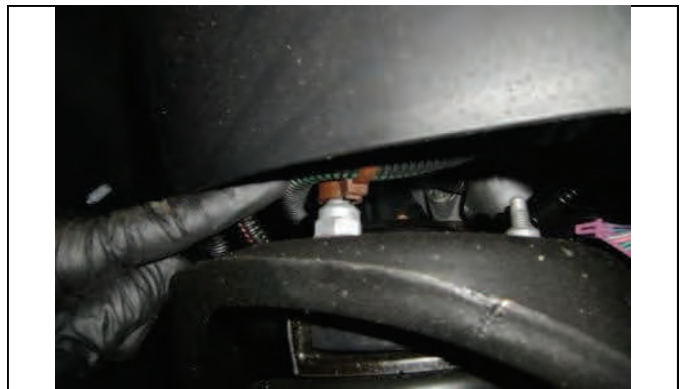
Pry up ABS retaining clips from upper strut mounting nuts