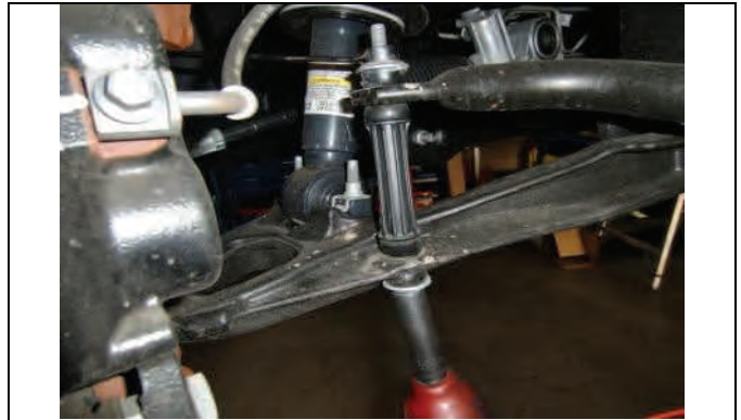
Disconnect dr/pass sway bar end links