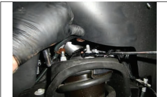
Remove upper strut mounting nuts