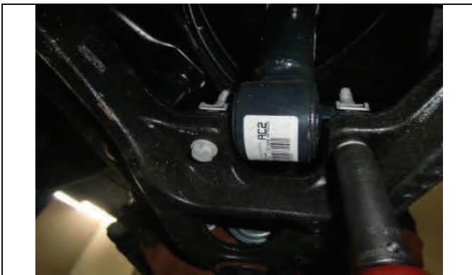
Remove lower strut mounting bolts