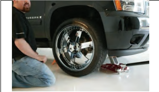
Raise and support front of vehicle frame on jack stands