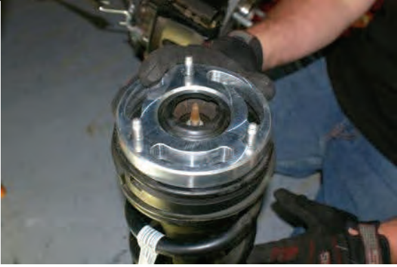
Place strut extension spacer on top of strut

Reinstall strut assembly in vehicle with the new provided hardware on top and the OE fasteners at the lower mount. Reattach the sway bar end links and ABS/brake line bracket. Note: Vehicles installing 66-3085 with the lower strut spacer perform the following steps to complete installation.