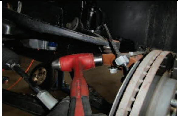
Carefully strike spindle as shown to separate ball joint.