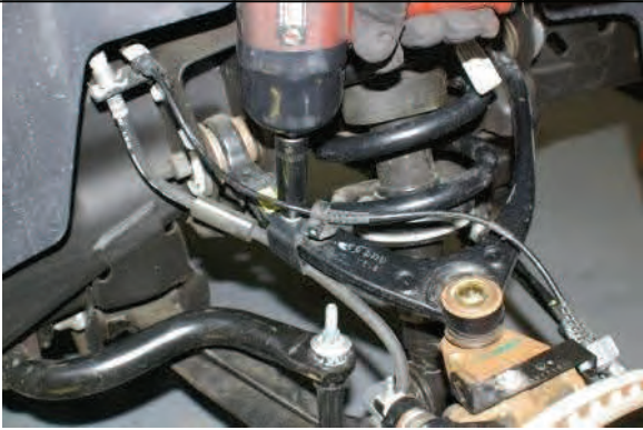
Reattach ABS/brake line bracket and sway bar end links

Reinstall wheels/tires and torque to spec. Re-check all work performed, test drive and have vehicle aligned.