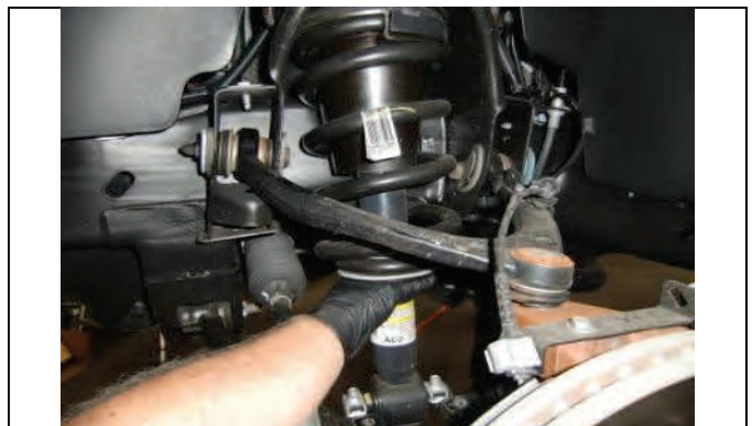
Remove entire strut assembly from vehicle.