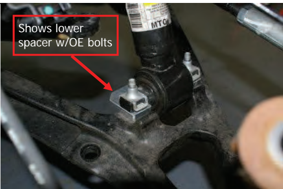
Use new nuts for upper and OE bolts with lower spacer.