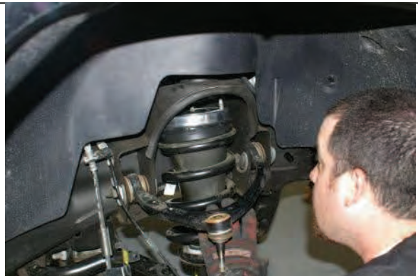
Lower suspension slightly and reinstall strut assembly