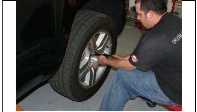
Remove front wheels/tires