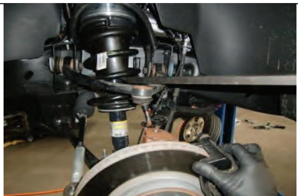
Lift suspension slightly while prying down to attach ball joint.