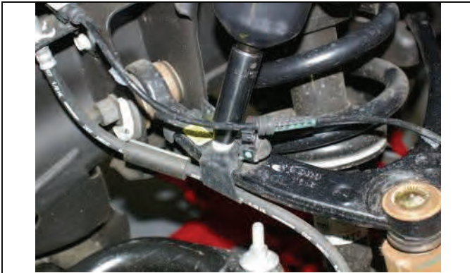
Disconnect ABS/brake bracket from upper control arm.