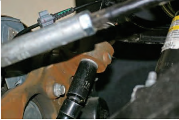
Tighten upper ball joint to spec.