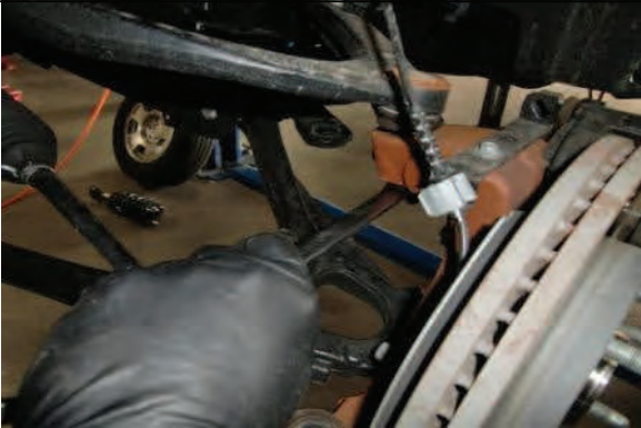
Loosen upper ball joint nut and leave attached.

Reinstall strut assembly in vehicle with the new provided hardware on top and the OE fasteners at the lower mount. Reattach the sway bar end links and ABS/brake line bracket. Note: Vehicles installing 66-3085 with the lower strut spacer perform the following steps to complete installation.