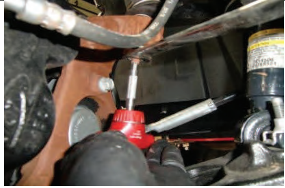
You may need to hold stud with hex key while tightening